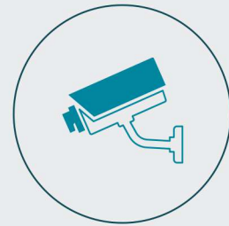
Safe & secure residential building