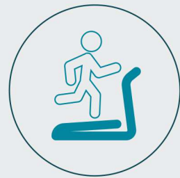
Stand-alone bespoke gym