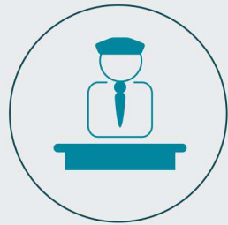
Spacious lobbies with concierge service