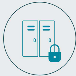
Changing rooms and lockers